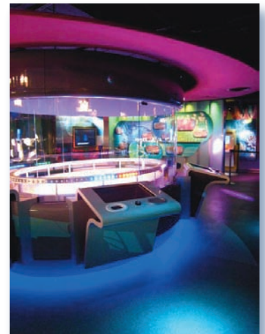
Exhibit Design: Lee H. Skolnick Architecture + Design Partnership Completed: 2008

visitors encounter interactive exhibits that explore topics ranging from Virtual Surgery to Nanotechnology and from an HDTV studio to robotics. A sophisticated lighting system managing thousands of channels for controlling LED nodes, automated moving lights, traditional spotlights, theatrical effects projectors, etc. seamlessly receives commands from the master AV control computer. The design of the lighting is tightly integrated into the structures contributing to an experience that is at once exciting and enlightening.