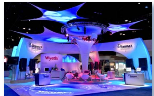
Exhibit Design: Exhibitgroup/Giltspur